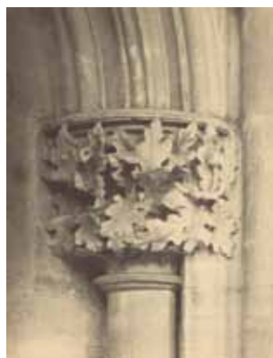
1. Frederick H. Evans British, 1853–1943 Southwell Cathedral - Chapter House Capital, 1898 Platinum print Image: 11.4 x 8.7 cm (4 1/2 x 3 7/16 in.) The J. Paul Getty Museum, Los Angeles 84.XM.444.54