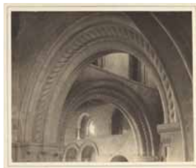
2. Frederick H. Evans British, 1853–1943 Southwell Cathedral - North Transept Triforium, 1898 Platinum print Image: 9.5 x 11.6 cm (3 3/4 x 4 9/16 in.) The J. Paul Getty Museum, Los Angeles 84.XM.444.46