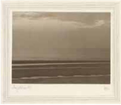
11. Frederick H. Evans British, 1853–1943 Ingoldmells, about 1900 Platinum Image: 9.7 x 13.5 cm (3 13/16 x 5 5/16 in.) The J. Paul Getty Museum, Los Angeles 85.XM.399